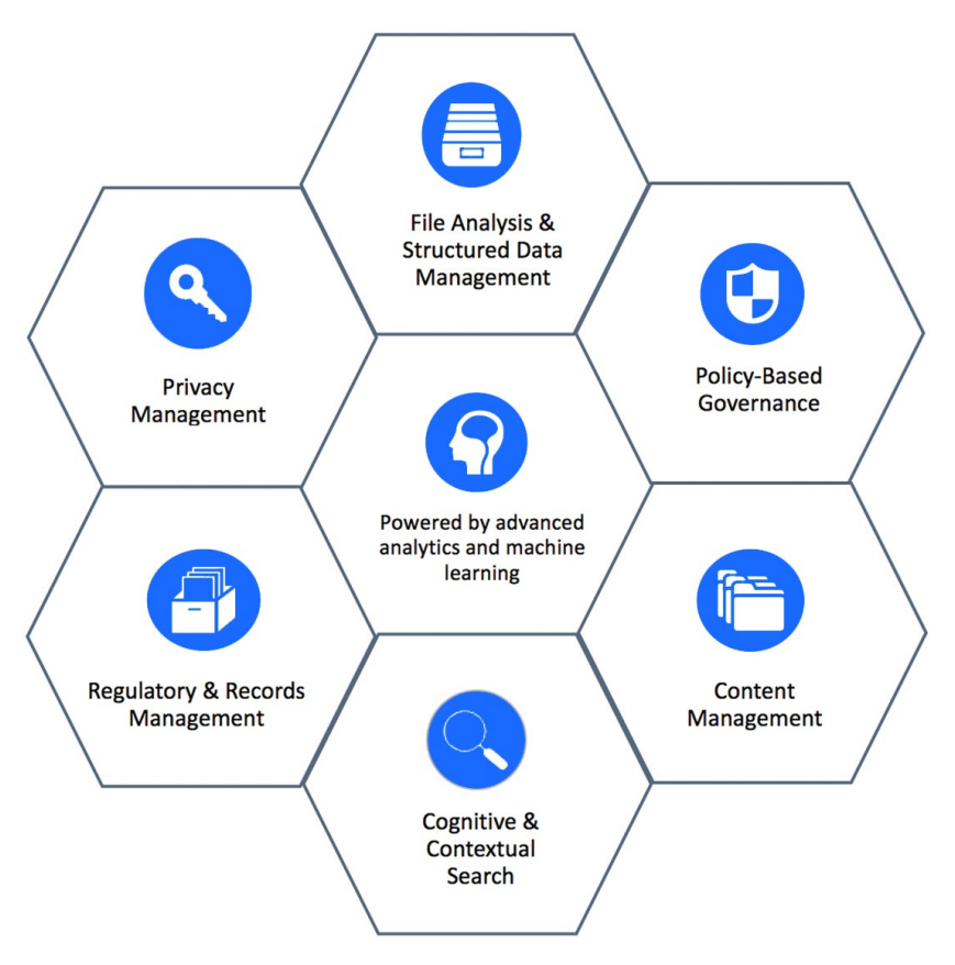
Figure 2. The OpenText Secure Content Management Suite, powered by advanced analytics and machine learning

Understanding how to address the information challenge, how to successfully address risk mitigation and understanding that this can lead to positive differentiation and value creation is critical but so too is understanding the huge benefits organizations can receive from having deep insight into their information. Powered by advanced analytics and machine learning, the OpenText Secure Content Management Suite provides actionable insights that power efficiency and control.