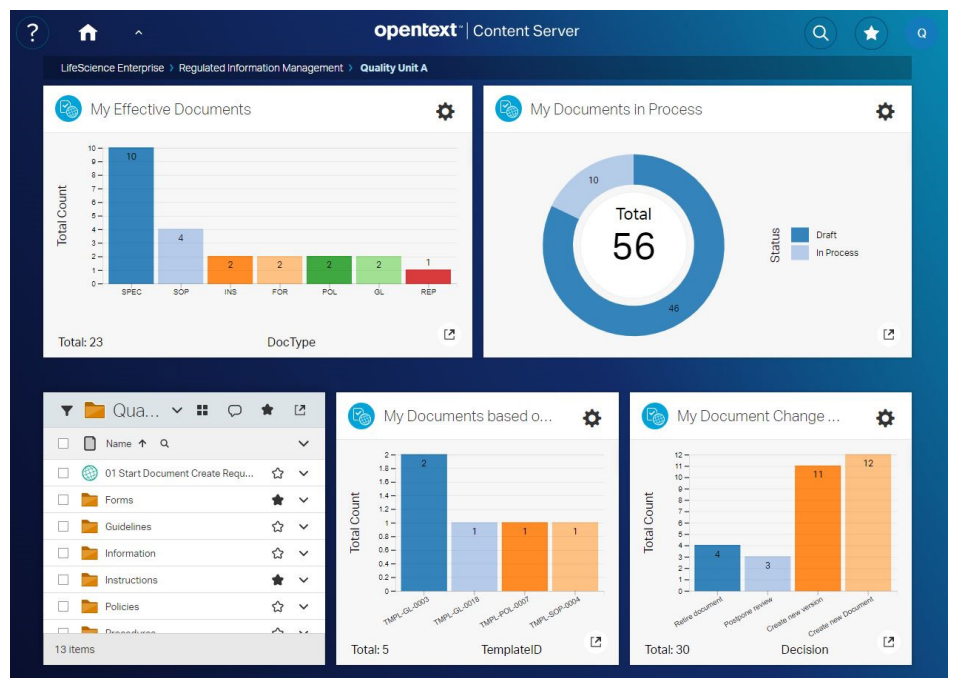
RIMS Quality dashboard

OpenText RIMS provides greater visibility and control of your regulated documents. The ease-of-use increases the user adoption to eliminate paper and assure compliance and quality. Predefined best practice workflows enable efficient document control processes which helps the business users to stay on task with approval, periodic reviews, training and withdrawal processes. Quality managers can monitor status and collect metrics based on flexible reports and dashboards which can be adopted to your specific requirements.