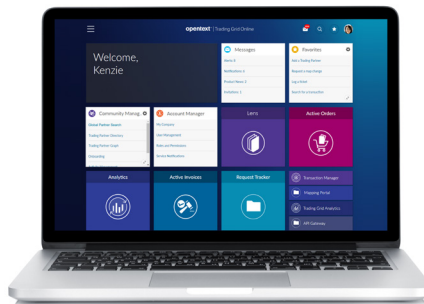
Trading Grid Online is the single sign-on portal for accessing all Trading Grid applications