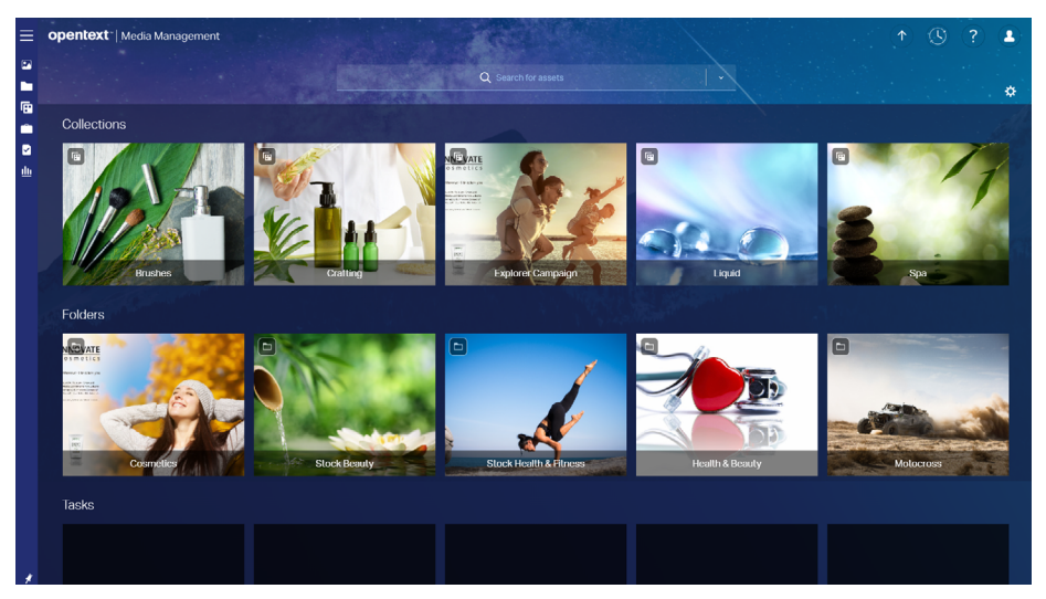
Personalized home pages show each user the assets and projects most relevant to them and display important messages that promote user engagement.

Marketing channels, social media and other customer touchpoints are proliferating at an increasing rate and it is becoming more difficult to get the right content delivered to the right channel without losing visibility into the governance of assets and brands. All of this is happening while departments are under pressure to reduce spend.