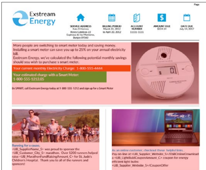
Highlighted message frames make it easy to identify areas you can edit