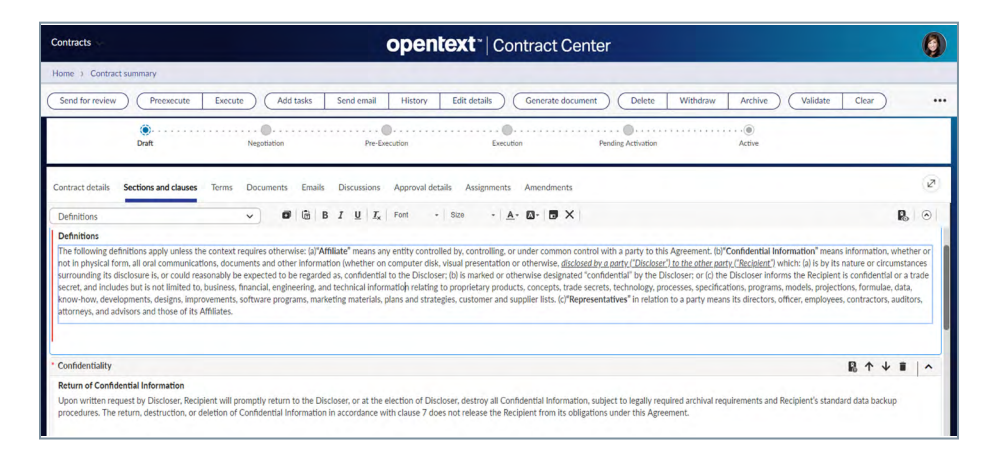
Leverage a library of approved clauses and predefined terms to simplify contract authoring.

With Contract Center, organizations gain a collaborative space where all stakeholders can access the contract, ensuring contract review and completion in an efficient way so that nothing falls through the cracks. Leveraging the library of predefined clauses, along with equivalent terms and the ability to clone existing contracts, further improves productivity. Through integration with Salesforce®, contract creators can automatically bring in contact details for customers, partners and other parties managed within Salesforce. In addition, integration with DocuSign® further accelerates contract execution with e-signatures, which are maintained in the contract record.