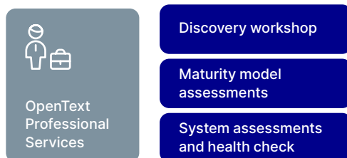
Figure 1. OpenText Professional Services OpenText Content Manager assessment approach