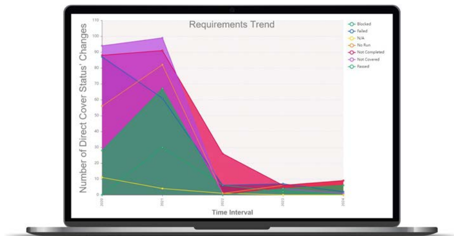
Example of OpenText Application Quality Management reporting