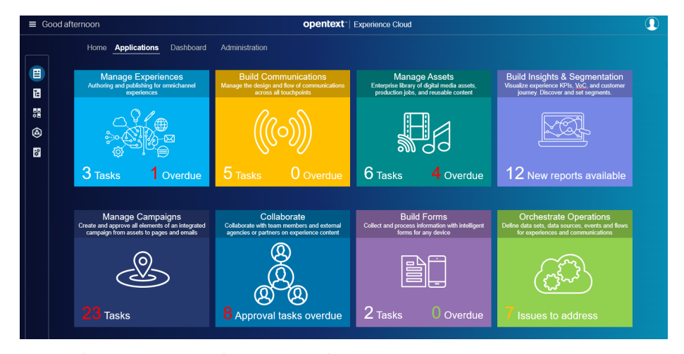
DXP for Retail Banking features a unified UX that provides insights and access

Digital experience technology provides critical visibility into operations and enables banks to quickly adapt to changing customer needs. By transforming into a digital, data-driven business through a content-centric approach backed by automation, banks optimize operations and reduce risk.