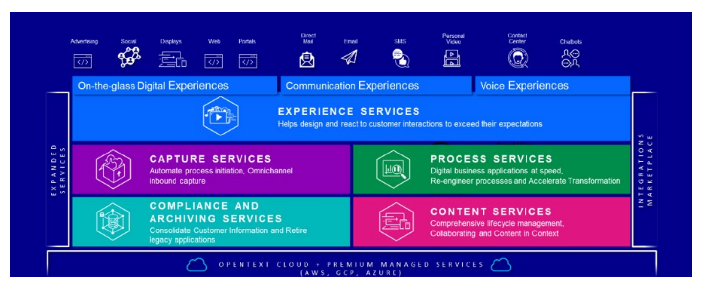
Total Experience for Financial Services