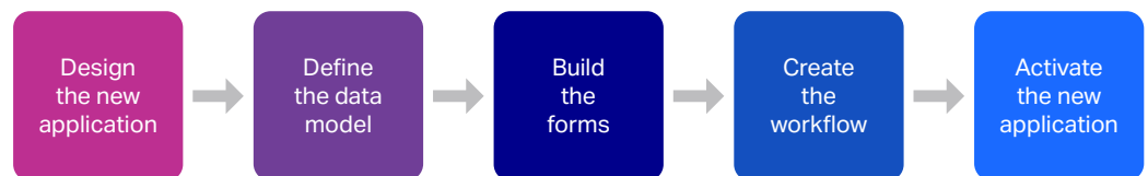
Figure 1. Five simple steps for creating an application with SMAX

Creating a new process-based application in SMAX is entirely codeless and easy to do. Figure 1 illustrates the five steps for creating the user-defined security vulnerability application from our example.