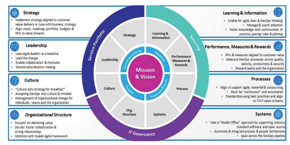
Figure 1. OpenText DevOps Operating Model