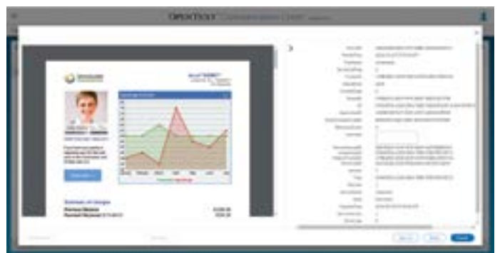
Communications Center templates

Embracing the shift to a customer-centric approach means providing a consistent digital experience across all channels — designing content and services delivered for each specific touch-point and aligned with customer needs and the business. User interaction has evolved from a single channel experience (single message for a single channel) to a multi-channel experience (different message for each individual channel) to an omnichannel experience (single message shared across different channels). Customers don't see individual devices or channels; they look for a consistent and familiar brand experience. Leveraging analytics and predictive modeling can provide insight into customer preferences and provide a better experience at each future interaction.