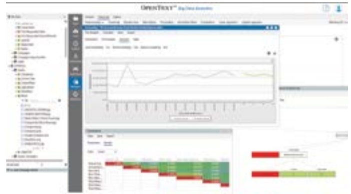
Experience Analytics - Predictive reports