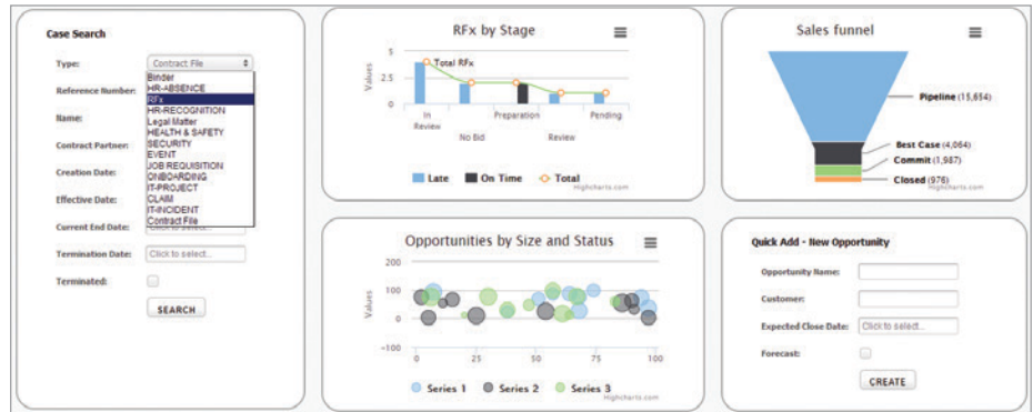
Role Centric Dashboard

Whether working within Content Suite or integrating to external data sources, WebReports is an indispensable tool for Content Suite developers and power-users. It creates the link between unstructured content and structured business data; delivering holistic management reports and enabling truly automated business processes. ■