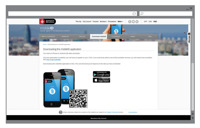
FIGURE 9.4: MobileID: an Innovative Mobile ID System

The City of Barcelona is an example of a smart city. It is using e-government solutions to transform itself into a connected hub for all city stakeholders to deliver quality services, improve its performance, and stimulate opportunities for economic development. The City markets itself as the mobile world capital, with 100 percent mobile access to services that bring the citizen closer to the city. Services are "one tap away" and include the innovative web-based mobile identification system, mobileID, supported by a secure mobile registry of users. This system enables citizens to log in to access government services using their mobile device. With their e-government system, the City of Barcelona has been able to increase citizen satisfaction and improve efficiency and productivity through the digitization and automation of internal processes.