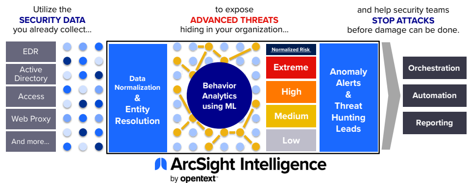
Figure 1. ArcSight Intelligence views your existing security data through a new lens in order to identify advanced threats (such as novel attacks, low and slow attacks, and insider threats) by looking for anomalous behavior. This produces high-quality threat leads, allowing your security teams to respond and remediate quickly and effectively.

Using unsupervised machine learning—a type of artificial intelligence (AI) that doesn’t need pre-labeled datasets—ArcSight Intelligence’s algorithms extract available entities (users, machines, IP addresses, servers, etc.) from