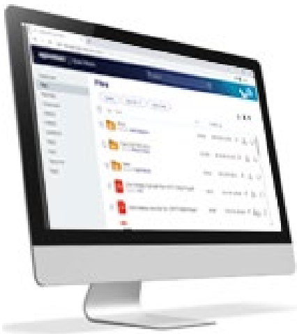
OpenText Core Share